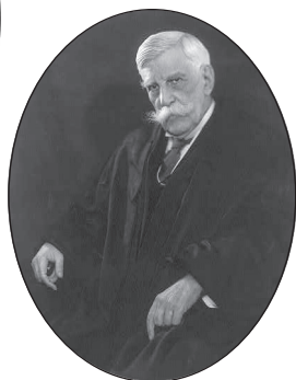
O.W. Holmes, Jr.

Cover Photo: The Holmes residence at 1720 Eye St., Washington D.C.